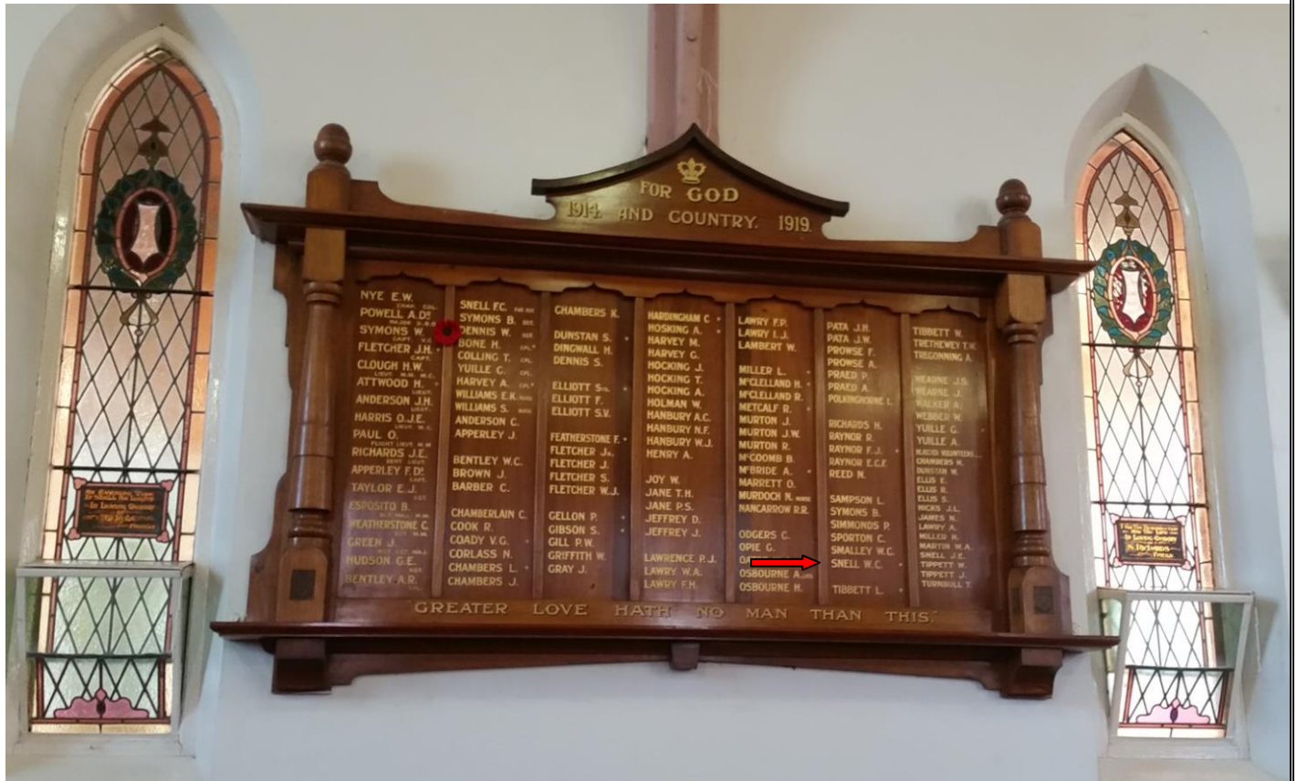
Eaglehawk Uniting Church Roll of Honour