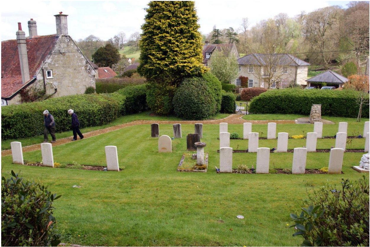
Photo taken from back of Cemetery looking towards the Entrance