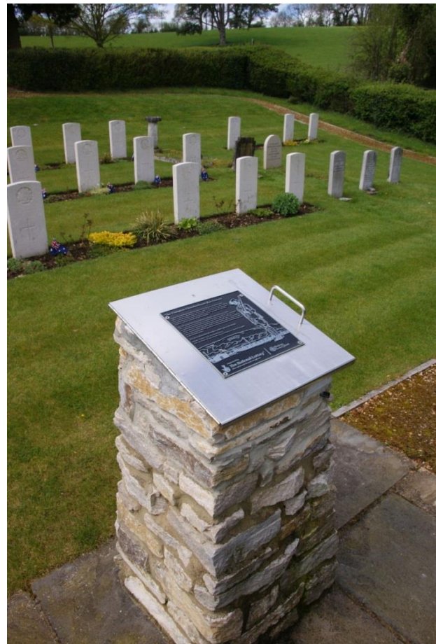
Left & right of Cemetery with central Plinth