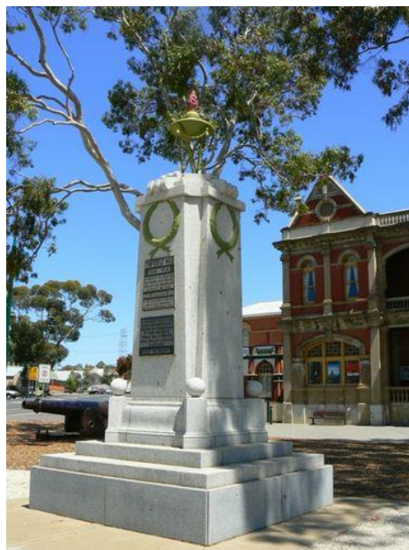
Eaglehawk War Memorial

The Eaglehawk War Memorial, located outside the Town Hall, Teg Leg & Sailors Gully Roads, Eaglehawk, Victoria does not list individual names.