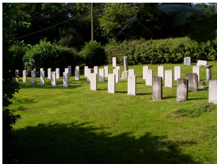
Compton Chamberlayne War Graves